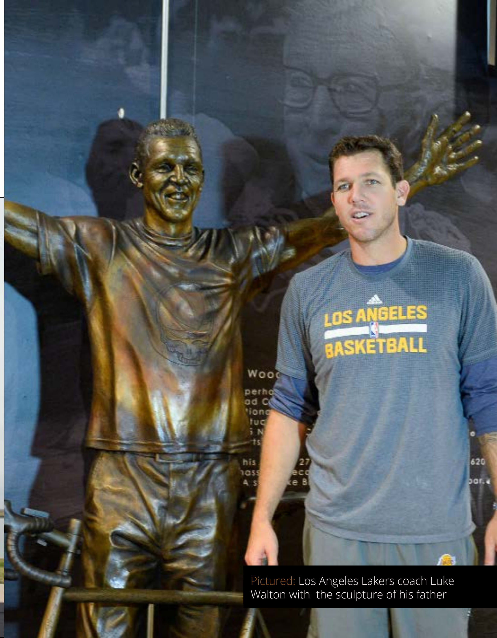
Pictured: Los Angeles Lakers coach Luke Walton with the sculpture of his father